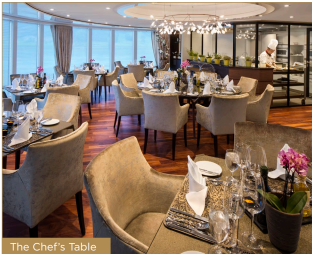
The Chef's Table

AmaWaterways' twin balcony ships represent some of the newest vessels in our fleet. Heated pools with a swim-up bar provide a tranquil environment for viewing stunning mountains and spired skylines. Plus, spacious staterooms afford guests comfort and privacy to rejuvenate while still experiencing the magnificent scenery.