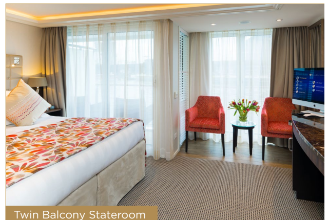
Twin Balcony Stateroom