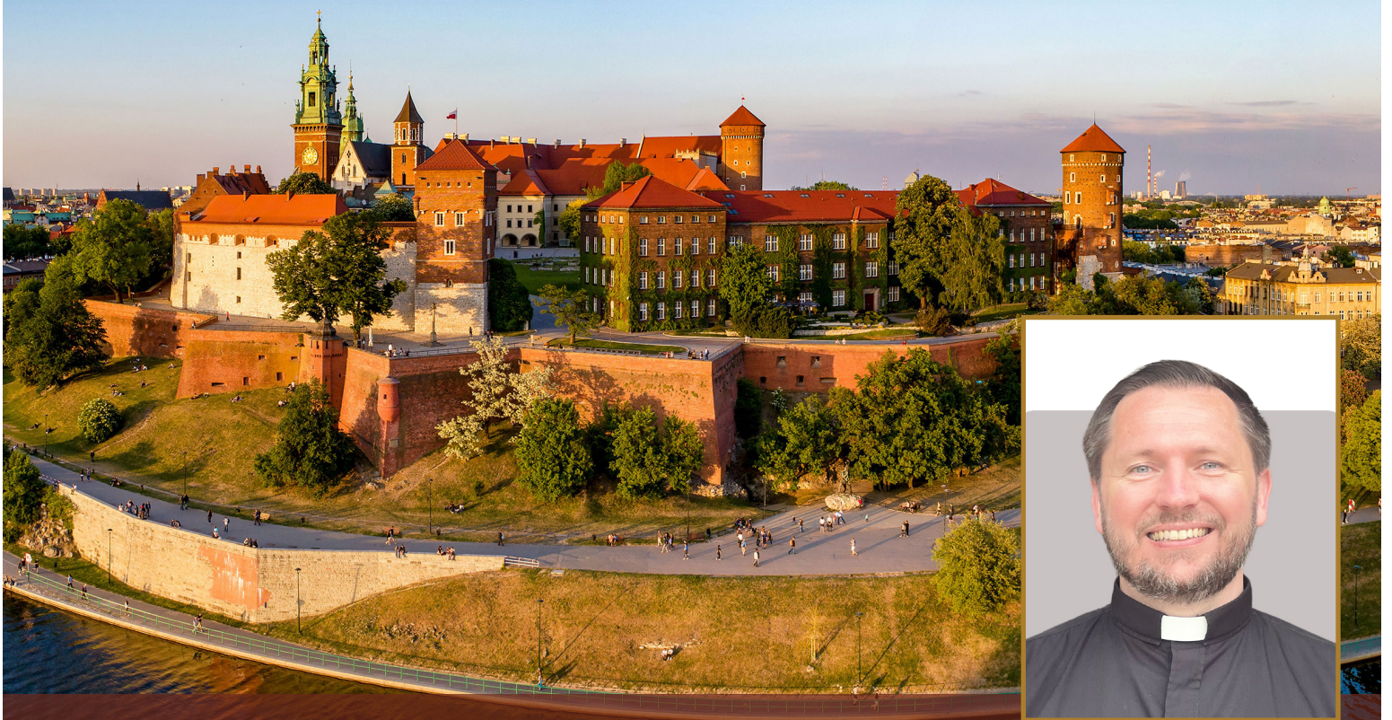
Wawel Royal Castle and Cathedral Krakow, Poland