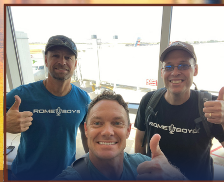
The Rome Boys