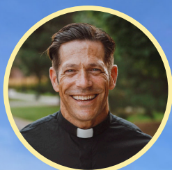
Fr. Mike Schmitz